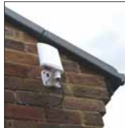
The kind of aerial typically mounted on your home or office.

Village Networks provides everything required to connect you. On the outside of your premises, a small aerial receives and transmits your broadband signal. The aerial has a cable to the inside of your property, where it's connected directly to a router, and then to your network. Power to the aerial is provided from a small power supply connected to a wall socket, then through the same cable that carries the data.