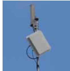
A typical Village Networks node aerial, which distributes the broadband connection to several locations.